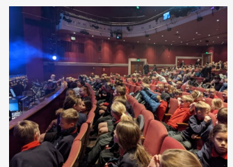
Beacon Federation pupils waiting for the pantomime to begin

The trip was truly a joint effort and very much enjoyed by all.